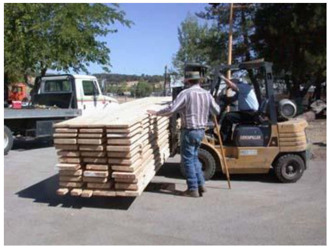
Photos: Upper Left—Bolts cut by Alaskan Chain Saw Sawmill ready for sawing. Upper Right—Sawing a bolt. Lower Left—Stacking cut lumber. Lower Right—Loading lumber on the truck.