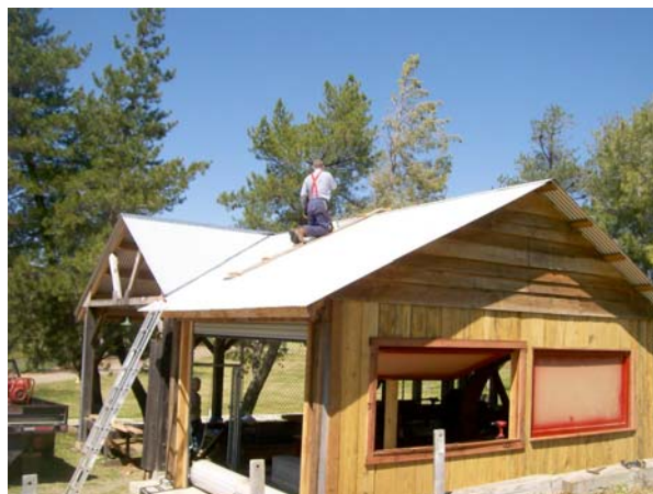
Engine room roll up door and siding