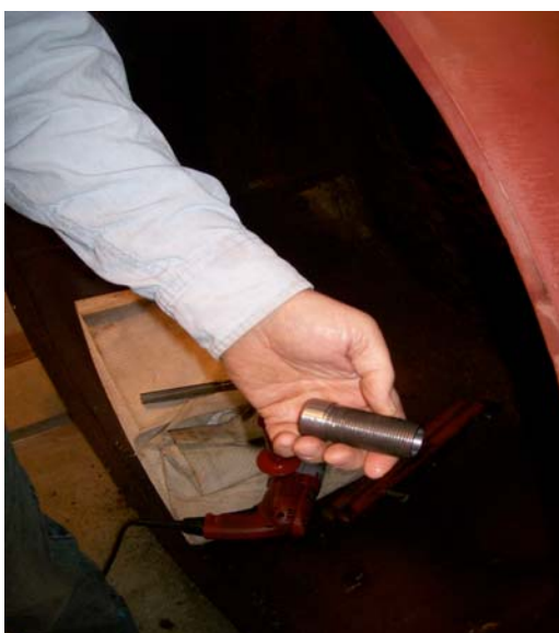
Stay bolt drill guide used to locate hole