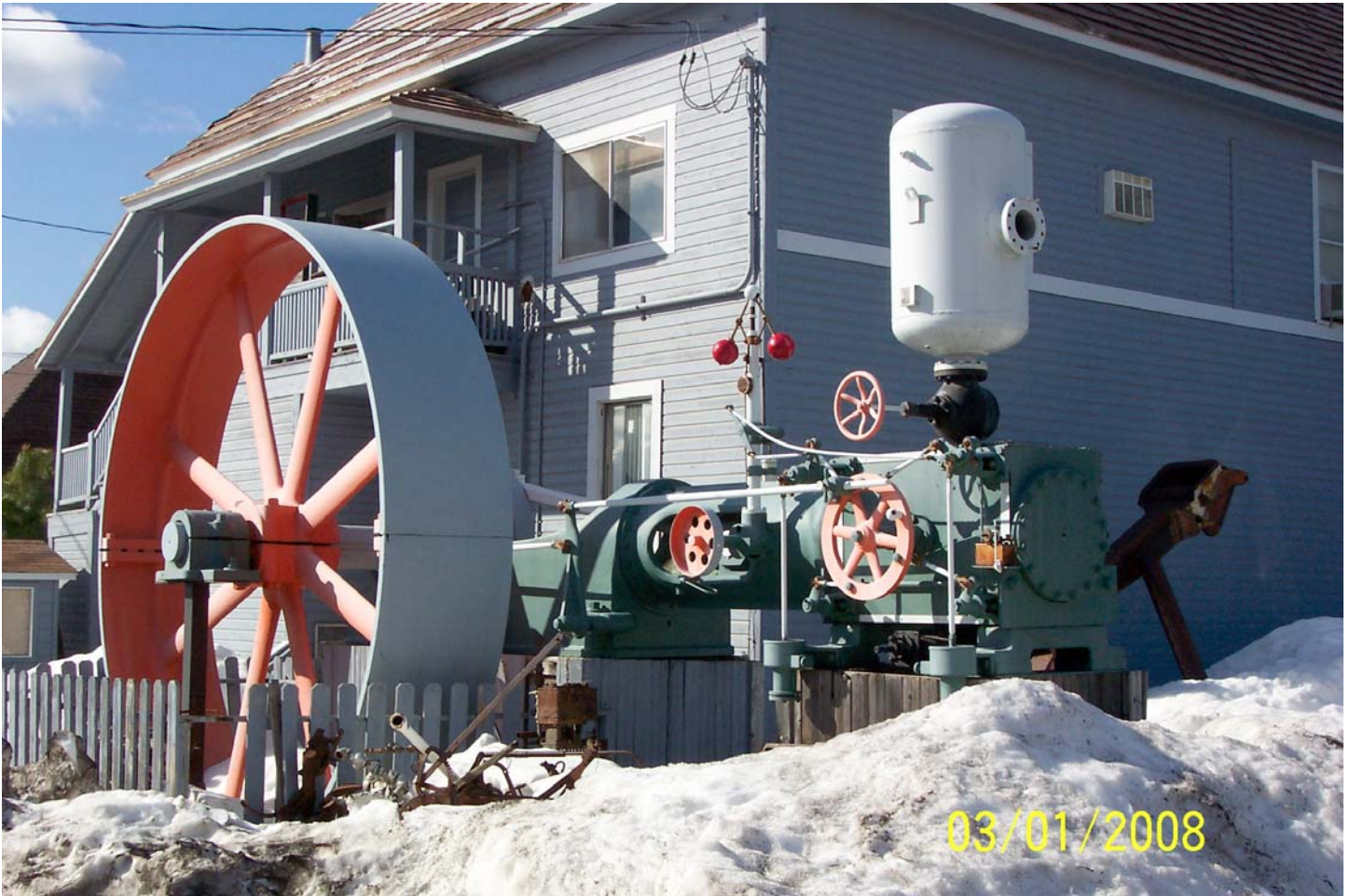
1903 Allis Chalmers Corliss Steam Engine Powered the McCloud Lumber Co. Sawmill 1903 - 1979 McCloud, CA