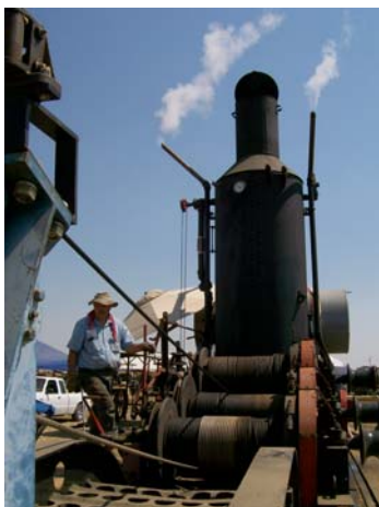
Getting up steam, 10AM