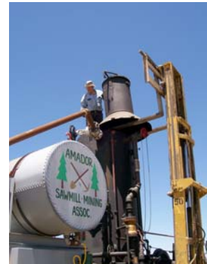
Setting the stack