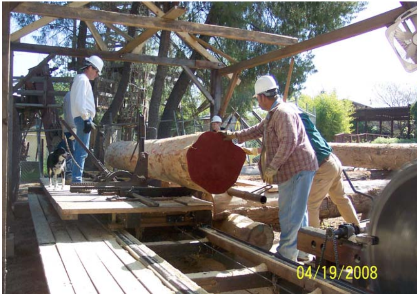
Centering a peeled log on the carriage

“The primary objectives and purposes of this corporation shall be for public purposes: acquiring, restoring, and preserving authentic historic working sawmill and hard rock mining equipment for Public education through display and demonstration, together with related activities.”