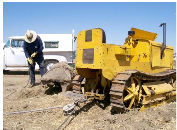
The "Whistle Punk" hooks up the choker cable

The award we won was presented by the Hedrick Museum.