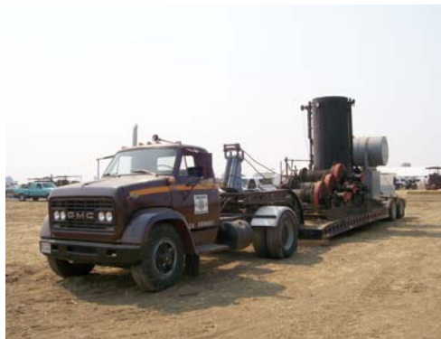
Spotting the rig at 6 AM