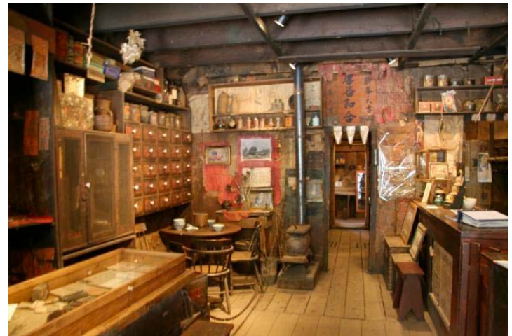
Fiddletown Restoration Society restoration project