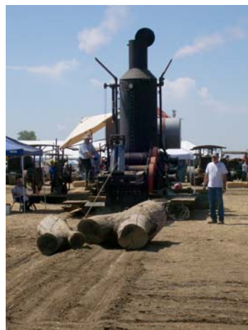
Chug, chug, chug, chug...