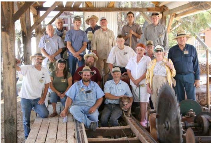
Sawmill crew at the Amador County Fair July 2008